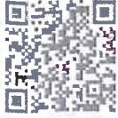
1 Alpha numeric QR Code