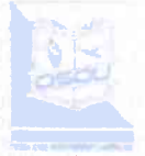
5 Transparent Security Impression