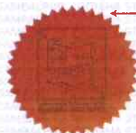
12 Variable data of Student UV